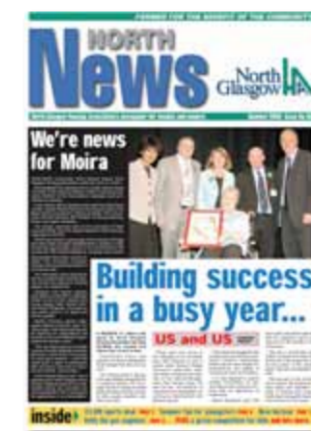
ISSUE 9 SUMER 2005