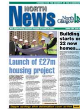
ISSUE 24 SUMMER 2009