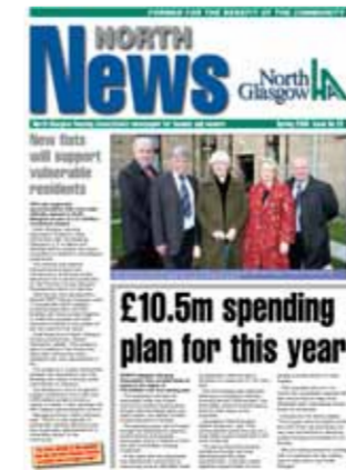
ISSUE 23 SPRING 2009