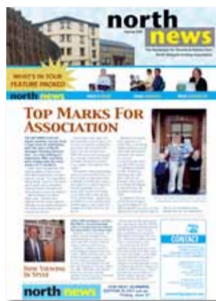
ISSUE 1 SPRING 2003