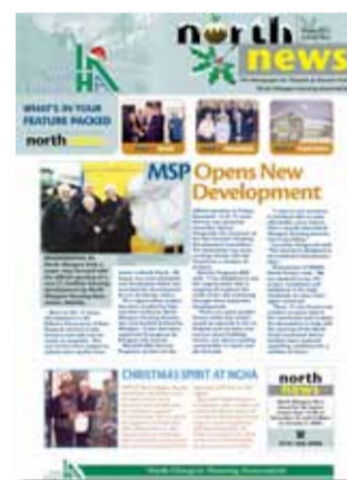
ISSUE 4 WINTER 2003