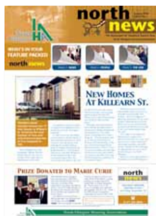
ISSUE 3 AUTUMN 2003