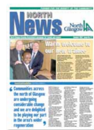
ISSUE 17 SUMMER 2007