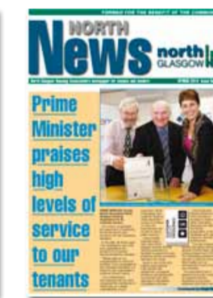
ISSUE 27 SPRING 2010