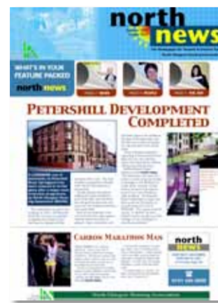
ISSUE 2 SUMMER 2003