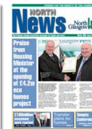
ISSUE 26 WINTER 2009