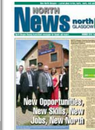
ISSUE 28 SUMMER 2010