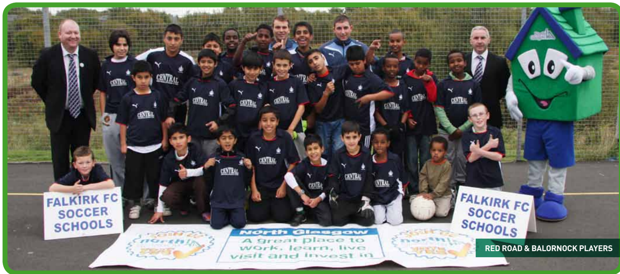
RED ROAD & BALORNOCK PLAYERS