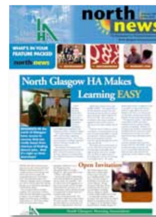
ISSUE 6 SUMMER 2004