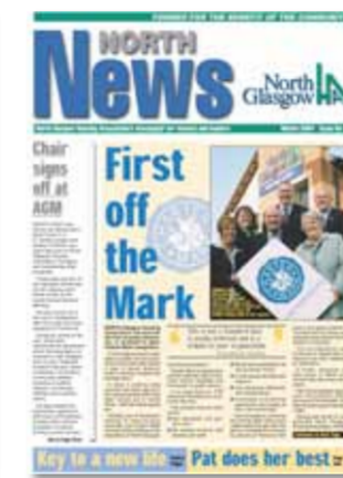
ISSUE 7 WINTER 2004