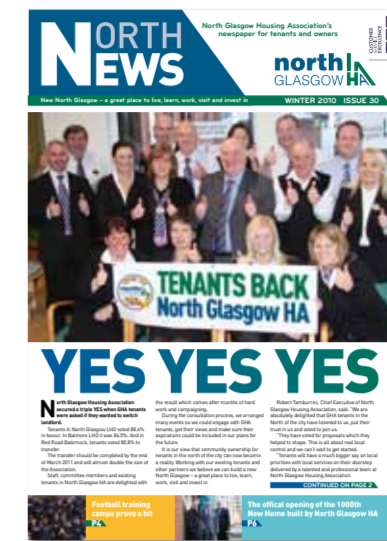
New look for the 30th Issue

Our newsletter is regarded as one of the best publications by a housing association. We hope you enjoy the new look.