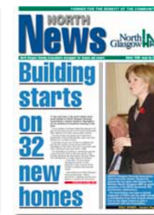
ISSUE 22 WINTER 2008