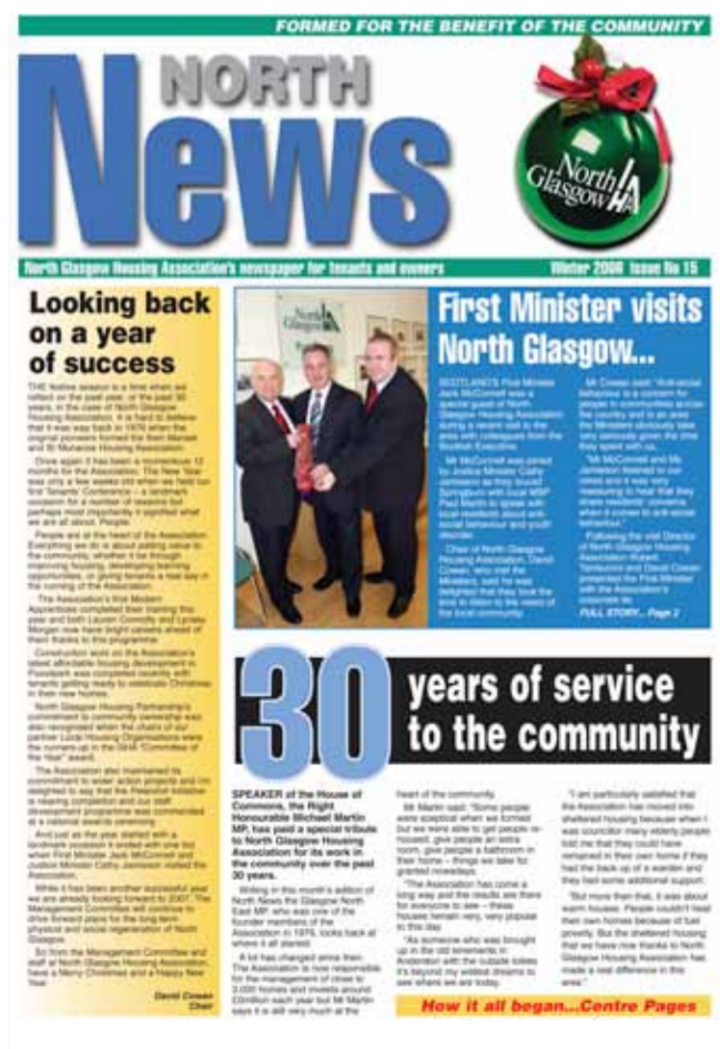
ISSUE 15 WINTER 2006