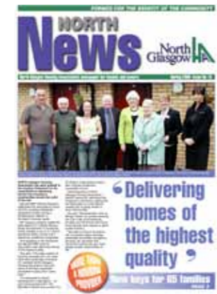
ISSUE 19 SPRING 2008