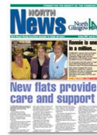
ISSUE 21 AUTUMN 2008