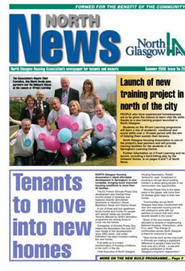
ISSUE 20 SUMMER 2008