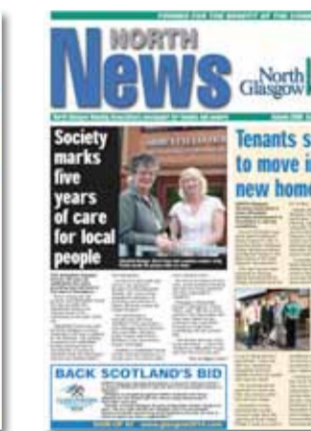
ISSUE 14 AUTUMN 2006