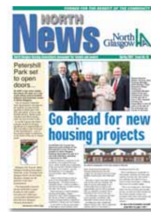
ISSUE 16 SPRING 2007