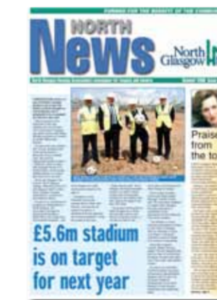
ISSUE 13 SPRING 2006