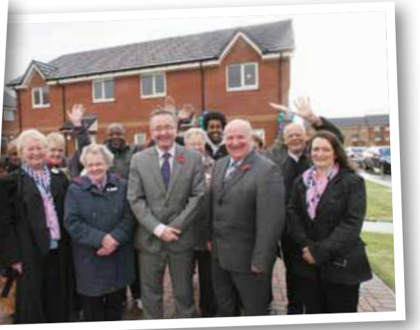
Local residents enjoy the occasion with the cutting of the cake.