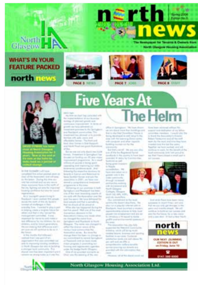
ISSUE 5 SPRING 2004