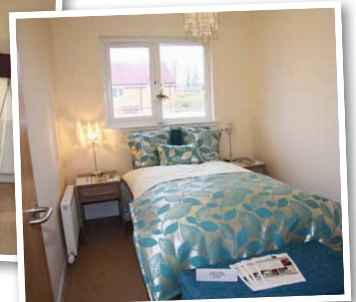
Lovely new interiors of the special show home.