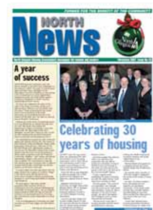
ISSUE 18 WINTER 2007