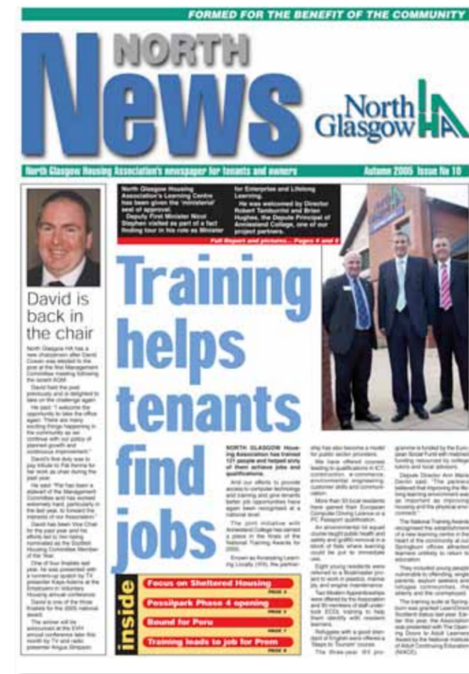
ISSUE 10 AUTUMN 2005