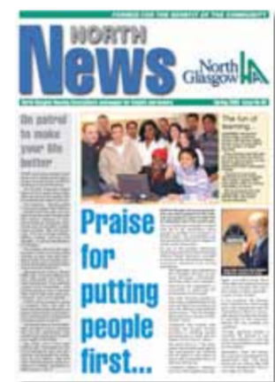
ISSUE 8 SPRING 2005