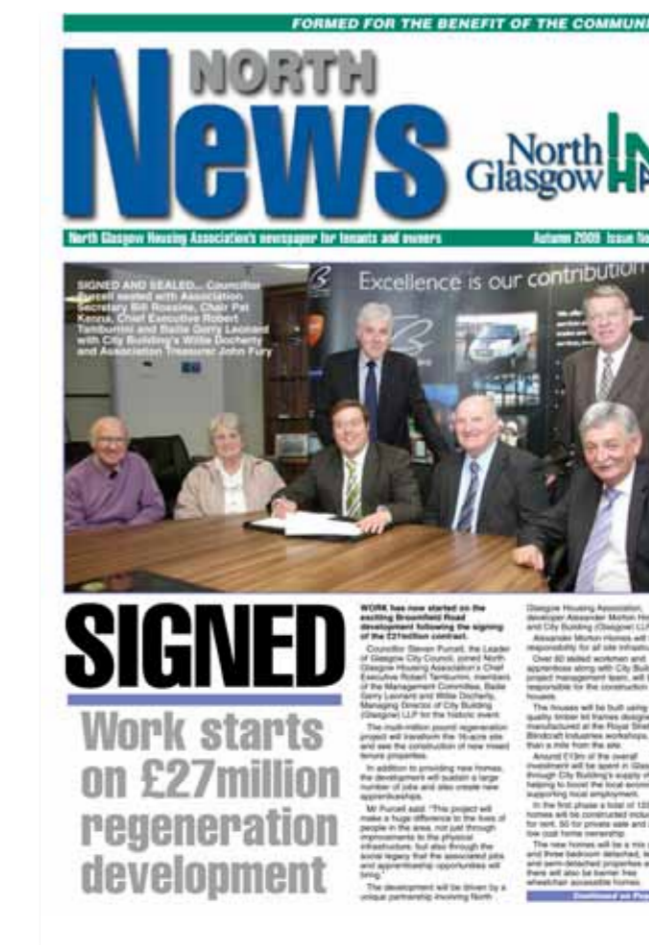
ISSUE 25 AUTUMN 2009