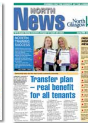
ISSUE 12 SPRING 2006