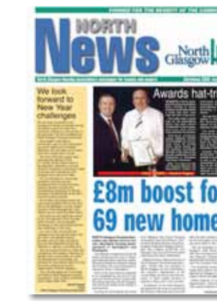
ISSUE 11 WINTER 2005